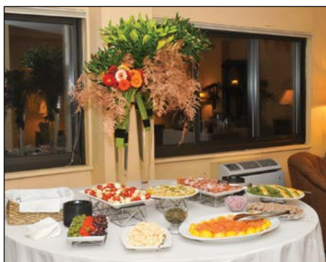
Above: Before the festivities heralding 150 years of service to older adults begin!