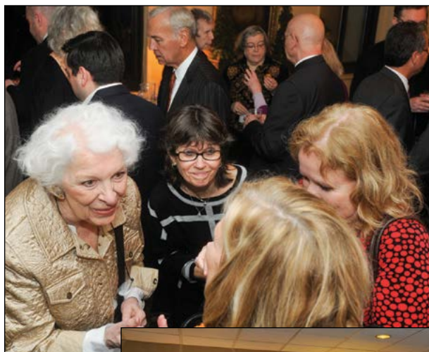
Right: Getting started! Celebrating our 150th Anniversary, over 300 guests attended.