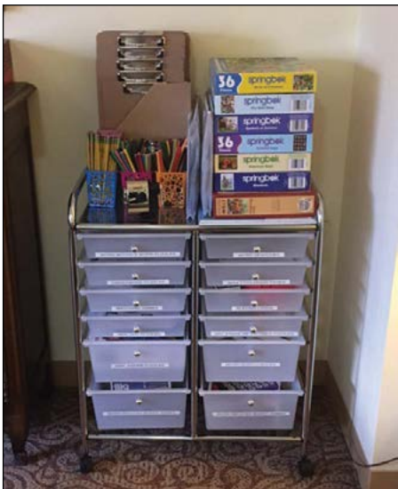
The puzzle cart

Since the first visit in October, it was evident how quickly the two generations had bonded, and almost immediately, sounds of lively conversation filled the room. In December, with a holiday theme in mind, students threw a party, complete with raffles, holiday songs, fruit cake, games, and more! That day, each attendee left the Hupper Room with a prize, a new friend, and a smile.